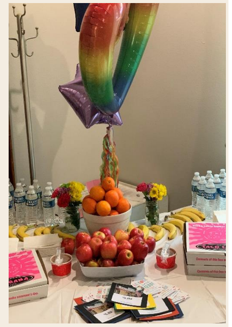
The Board of Trustees provided a backto-school brunch with coffee, breakfast tacos, & gifcards to welcome back the Calvary teachers & staff in late August.

Other volunteer opportunities or ways to get involved include volunteering as a Classroom Parent, Classroom Annual Fund Reprentative, joining the Spring Fling Committee, or becoming a Board Member. All volunteerism is appreciated!